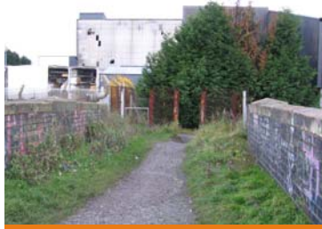
Cartmel Drive bridge - before