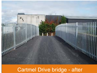
Cartmel Drive bridge - after